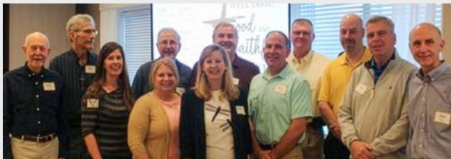
Anniversary Awardees being recognized at the 2026 Celebration Dinner